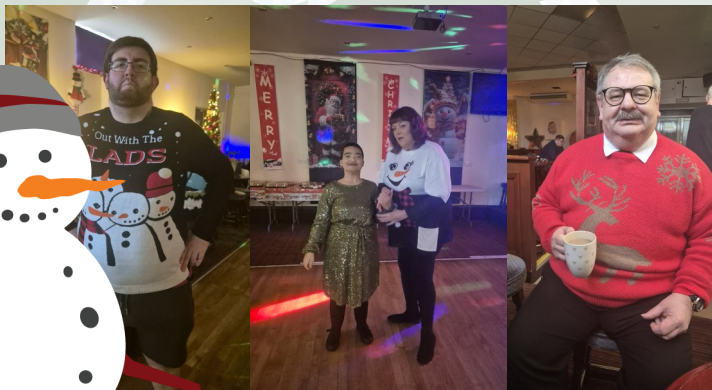
Hinckley's Very Merry Christmas Party!

It's been a challenging year, but I am extremely proud of our staff and management team. Well done for all your hard work and dedication! As we look ahead to 2025, I am excited about the potential achievements and opportunities that await. Let's continue to work together and make the upcoming year even more successful.