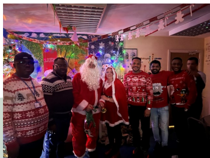
Thurmaston Staff Team with Festive Cheer!